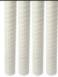
PP Filter Cartridge Housing