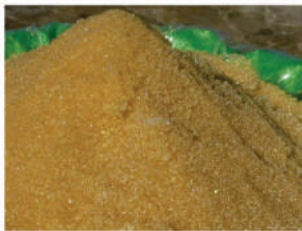
Ion Exchange Resins