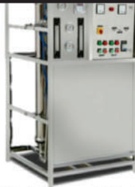
Drinking Water RO Plant