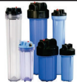
PP Filter Cartridge Housing