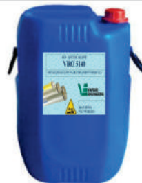
water treatment chemicals