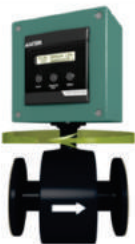
Electromagnetic Flow Meters