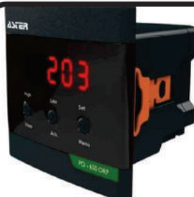
Online PH Meter